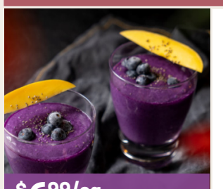
$699/ea. Earth Fare Purple Rain Smoothie 16oz SAVE $1/ea.